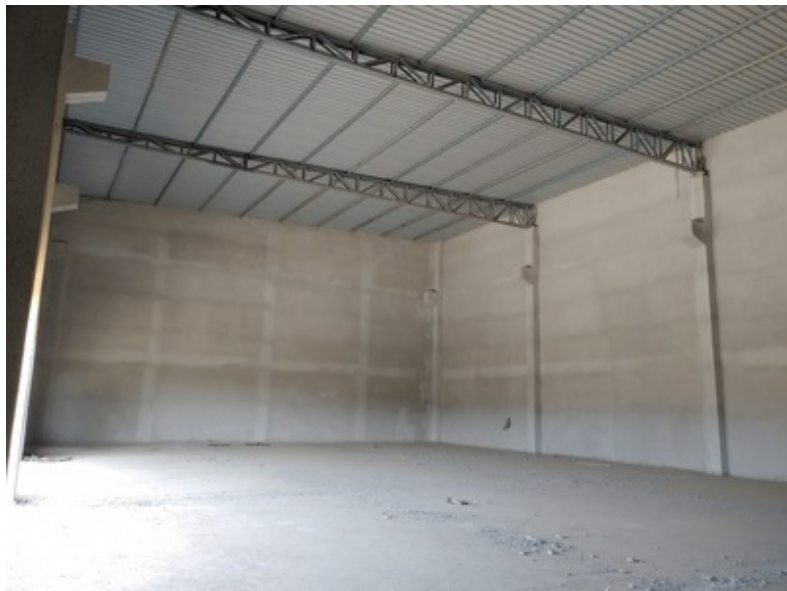
Pillar less Internal Area