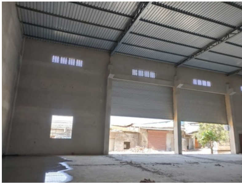
Heavy Duty Floor