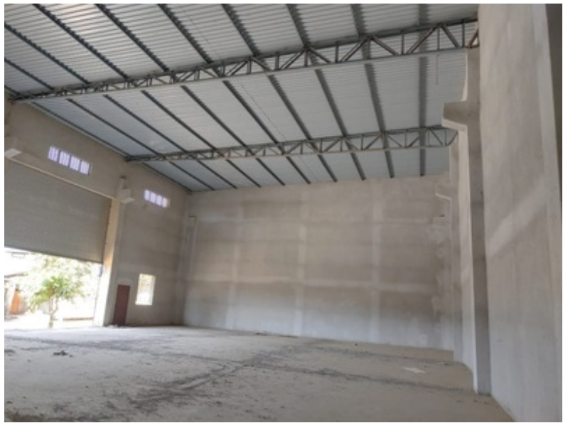
Facility for internal crane Installation