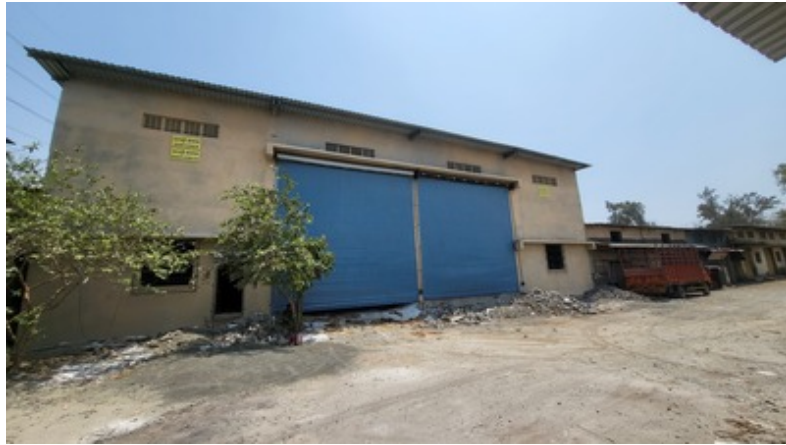
Front View From Corner