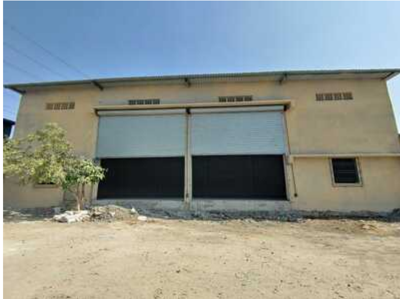
Front View With Two Big Size Shutters